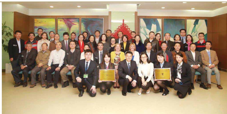
Top: Launch of the China Association