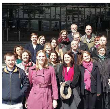
Left: First meeting of the Midlands Network